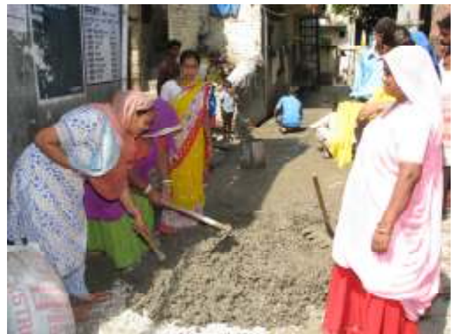
Above: The women’s group of Ekta Vihar after successfully lobbying for a new pathway in their area

The women’s groups continued striving to change attitudes and improve environments this year. The women of all slum areas have achieved so much over the last few years that they are held in very high esteem by their fellow slum residents. They have been involved in activities as diverse as helping children to gain admission to schools, motivating them to come for career counselling, encouraging people to have antenatal checks and to vaccinate their children. In addition, they have held many training workshops and public meetings, and have successfully lobbied for new toilet complexes and water supplies.