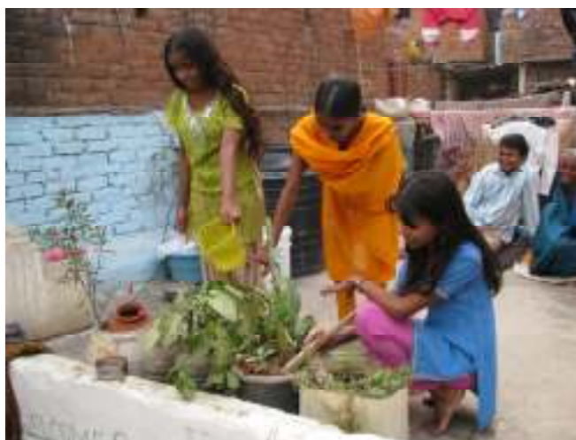
Girls in Tigri making the slum environment more pleasant for everyone

The children have also been working hard to encourage other children with their schooling and tackling the problem of school dropouts. Their work forms a strong foundation for Asha's education programme, and the children themselves are particularly keen pupils. They make good use of the books, newspapers and homework clubs at the children's resource centres, and their knowledge of English and computers is coming on well. They adapt well to any new activities, and we can see bright futures for all of them.