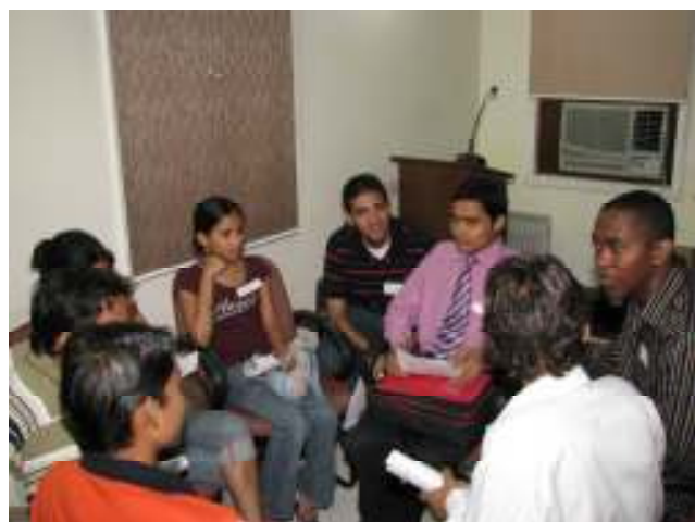
Right: Students from Harvard University holding a workshop on preparing for university with prospective students