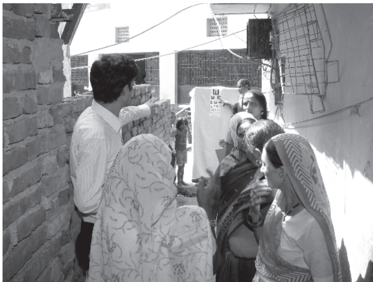
An optometrist visits a slum area to identify people with eye or vision problems

There are now 92 computers in Asha resource centres, and broadband internet connections in every one. 833 children have completed computer courses (see the inner pages for a success story!).