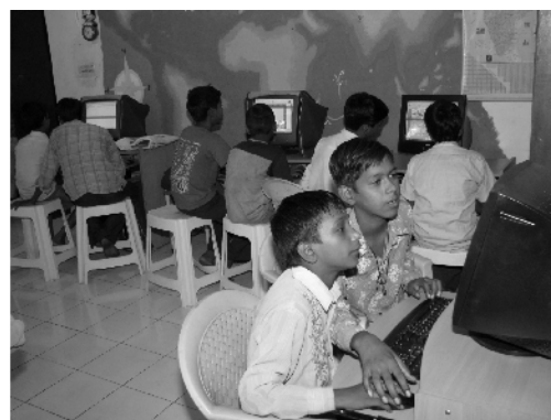
Enthusiastic students enjoying their new internet access

At the conclusion of the eight weeks, students undertake a proficiency test before receiving a certificate to mark the successful completion of their course. The large number of students attending the classes attests to the popularity of Asha's computer literacy program.