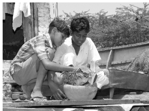
Bal Mandal members planting trees to revitalise their neighbourhood