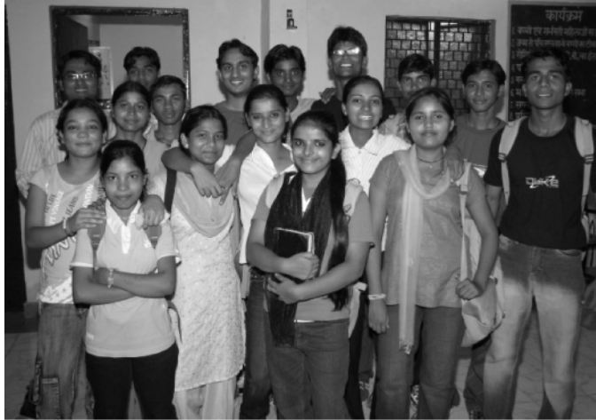
From Delhi slums to Delhi Universities – some of the remarkable students Asha has helped to gain college admission

Remember studying for your final high school exams? The pressure of having to prove your knowledge at the culmination of many years of hard work? Now imagine trying to concentrate while surrounded by your six brothers and sisters, who also share the same bedroom. Imagine having to study without the proper books and with little guidance from your school teachers or parents, who, if educated at all, may only possess a primary school education. For many children in New Delhi slums, this is a daily reality. It's no wonder the idea of college admission seems out of reach – there are so many obstacles to overcome.